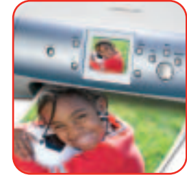
Large 2.5" LCD screen makes it easy for you to preview your photos.