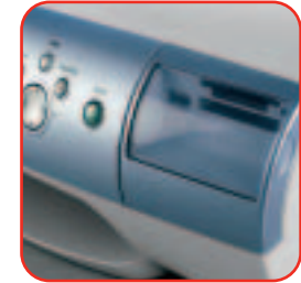
PictBridge and card slot capability makes printing easy and fast.