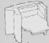
High Capacity Output Stacker (20G0896) Up to 1,850 sheets